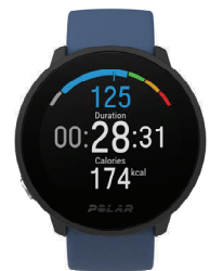
A fantastic choice for fitness and activity monitoring is the Polar Unite! www.PolarUSA.com

you’ve been sitting idle for an extended amount of time. That friendly vibration and notice on the watch face will keep you focused on your goals to keep active during the day.